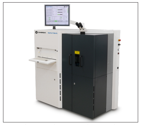
Figure 3. The StarCut Tube SL is a complete system that simplifies cutting valve scaffolds and other complex