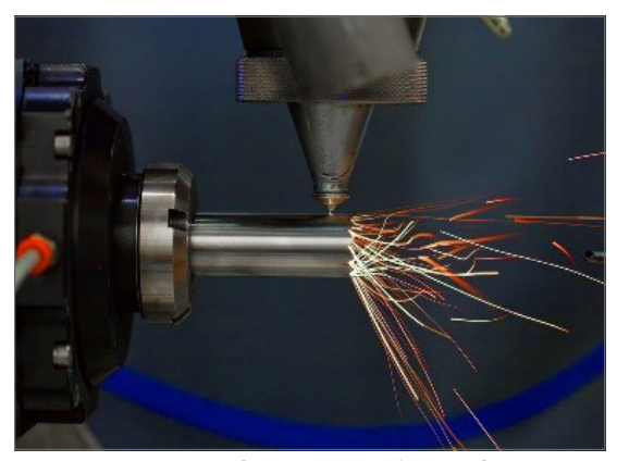
Figure 2. Laser cutting of a TAVR aortic valve out of a metal tube (e.g. nitinol).