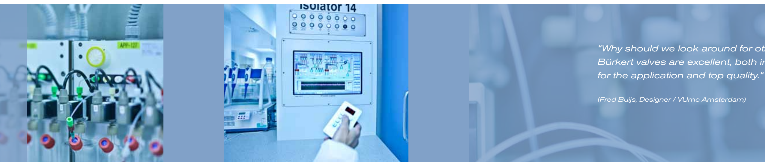
Die Ventile arbeiten vollautomatisch.